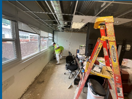
Principal office being prepped and primed for first coat of finish paint