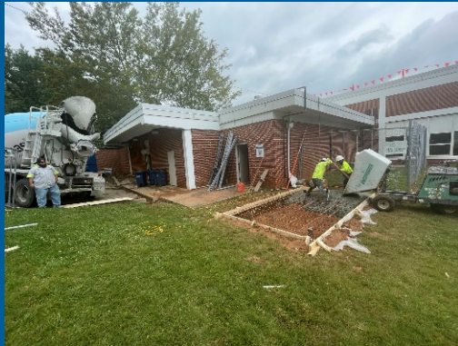
New Generator Concrete Pad Poured