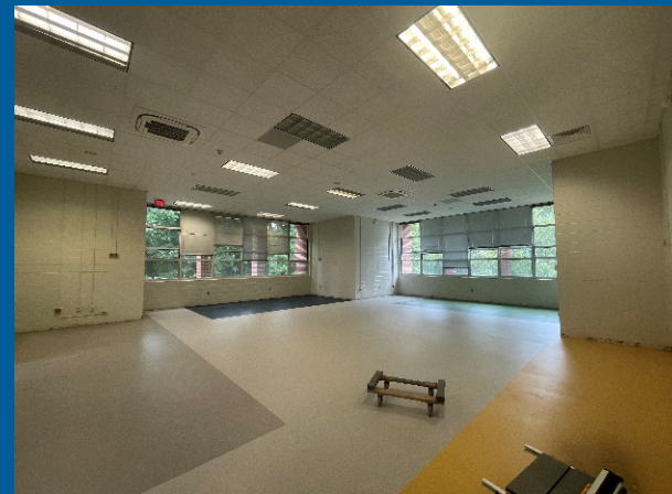
Library Ceiling Tile and Flooring Installed