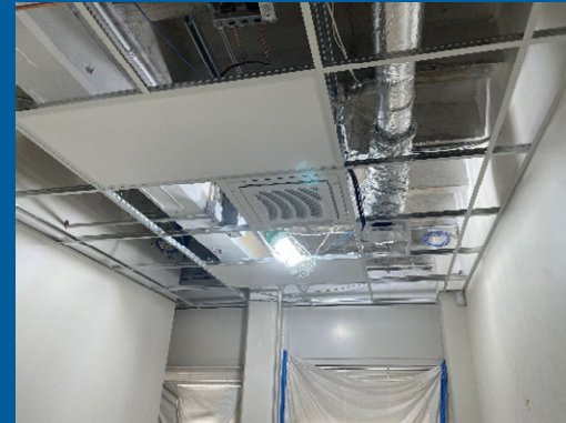
New offices/conference room ceiling grid and HVAC components installed